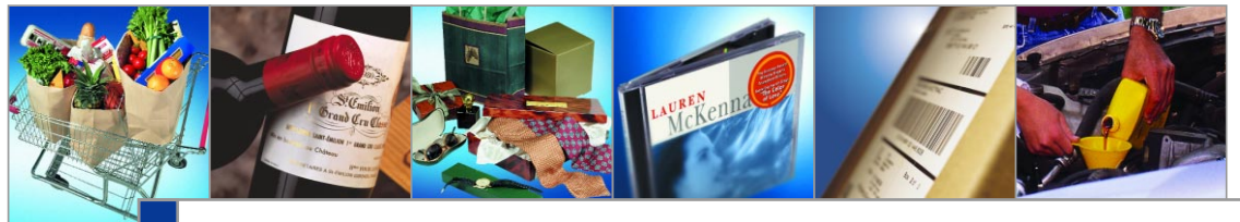
3138-N Dual Action Tamp