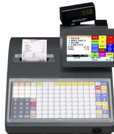
(actual display area: 142 x 80mm)